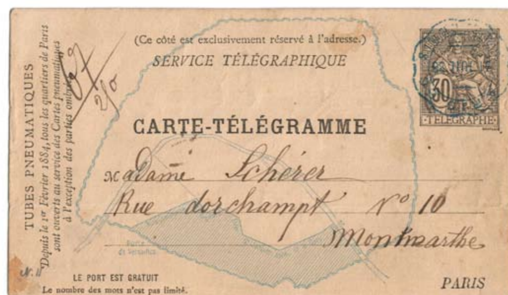
Figure 2 shows a 1895 pneumatic post card with an outline of Paris. The pre-printed stamp show the goddess Ceres with her Horn of Plenty. The words "Carte-Telegramme" emphasize that early messages were regarded as telegraph services. The wavy line postmark was also used for telegrams.

The 1866 Paris Pneumatic Mail service was replaced in 1984 by computers and fax machines. From 1879-1898 people could use official postal stationery.