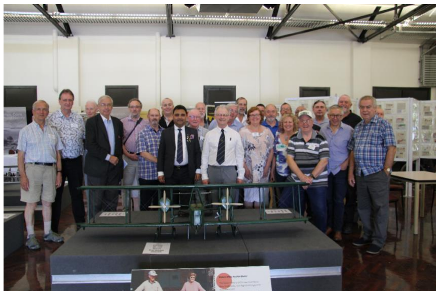
Members of the Royal Philatelic Society of London gathered for a meeting at the exhibition.