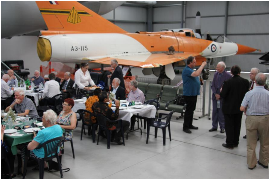
The Palmares was held in the Adelaide Air Museum.