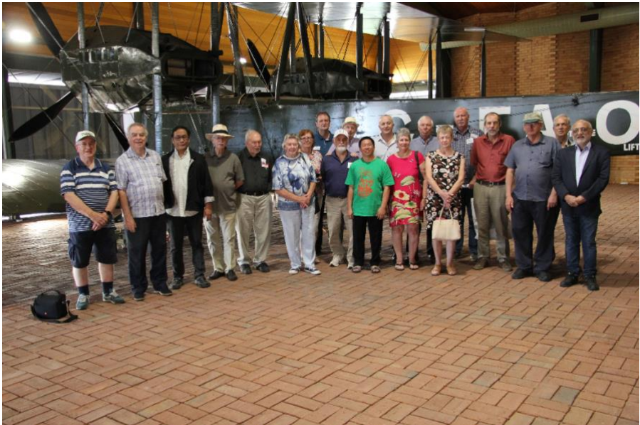
Part of a group that visited a number of sites connected with the Ross-Smith flight.

EXHIBITION RESULTS CAN BE FOUND AT www.apf.org.au